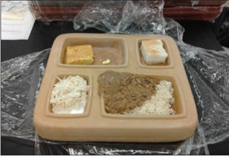
Meal served on April 14, 2012, demonstrates contact of items in large serving section.

17. Based upon a recommendation by the Michigan Department of Community Health, specimens were sent to their laboratory and analyzed for Bacillus cereus and C. perfringens . All six specimens were found to be negative for B. cereus and positive for C. perfringens . Confirmatory PCR analyses detected the presence of C. perfringens enterotoxin in all six specimens.